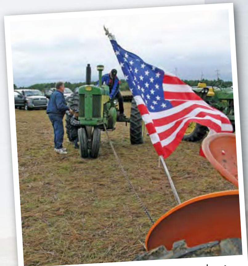
Proud Americans - tractor owners, anyway, always seem willing to lend a helping tow chain when needed.