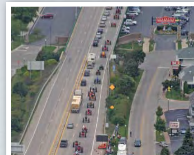
Tractors at the beginning of the bridge crossing form a nice line as they approach the water.