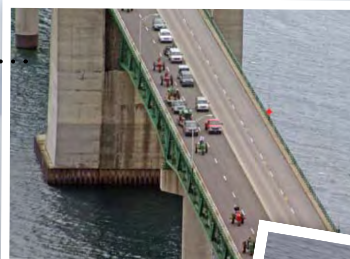
Across the center of the bridge, cars hurry past the bridge parade as tractor drivers smile and wave.